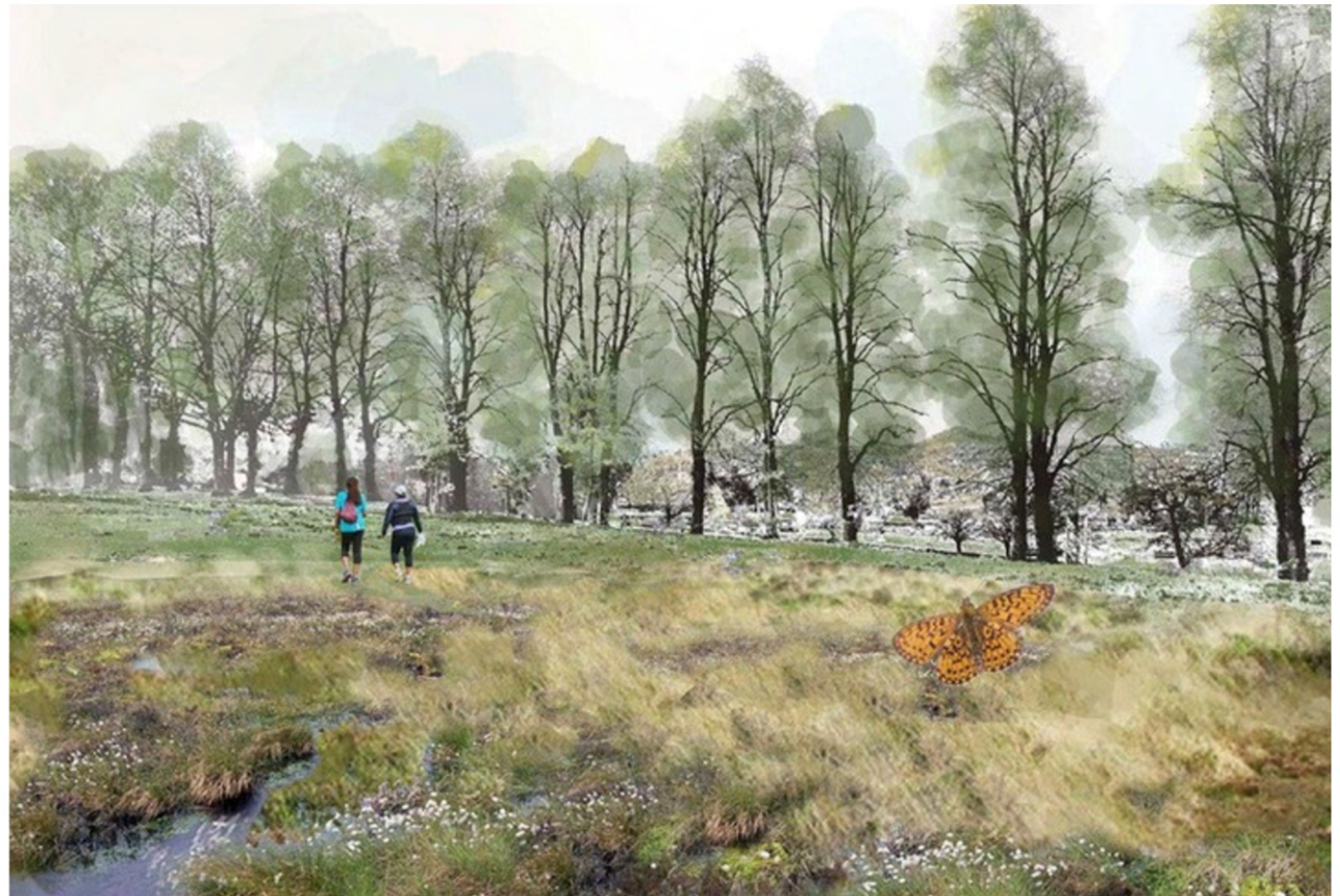
Image of what Inverleith Biodiversity Area could look like. (Inverleith Park Concept Masterplan Report produced by rankinfraser, 2022)

Conceptual masterplans seek to guide development of these sites and to ensure a coherent and inclusive vision for each. Placemaking and engagement approaches, such as the National Trust's Spirit of Place tool, have been used and have helped to capture what is unique and important about each site.