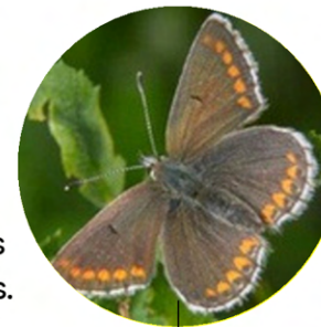
Northern brown argus butterfly

In 2021, Scotland's Park Managers Forum became a "Fast Follower" network for the Future Parks programme, and specifically the Edinburgh Thriving Green Spaces project, to share information and emerging learning with colleagues across all Scottish local authorities.