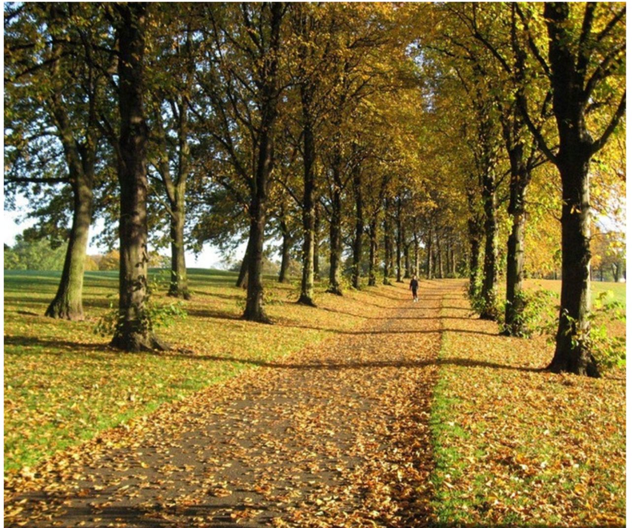
Walking under the autumn canopy at Inverleith Park